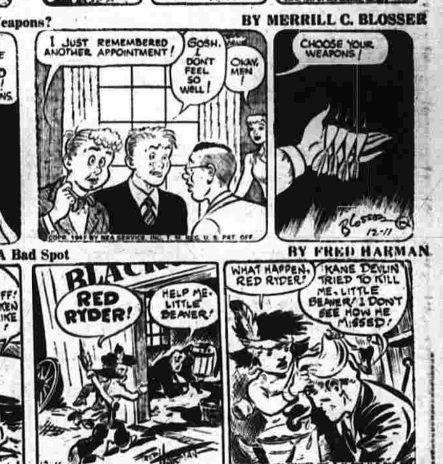
BY FRED HARMAN

Announcements 2 WANTED—Ride to United Air- craft, hours 8 to 4:45. Current license and license. Call 8260.