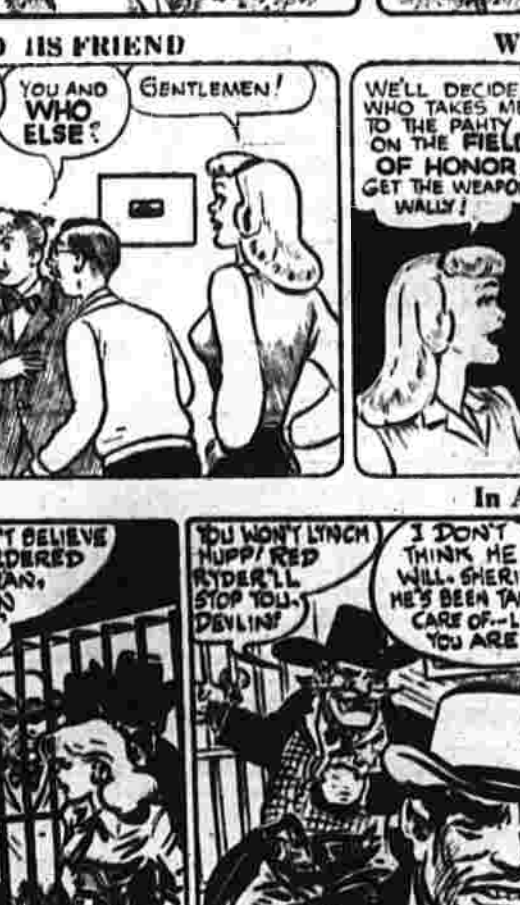
BY MERRILL C. BLOSSER