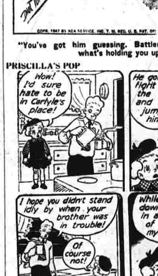
BY DICK TURNER